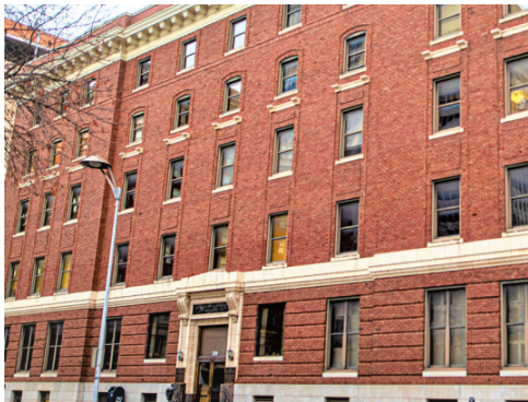
Rose Building 200 East 1st St N

Sophisticated offices set on the corner of 1st and Market, in the heart of Downtown, Wichita. The building is full of elegant features, such as marble flooring, a large, open lobby, and wood-finished offices with gold accents