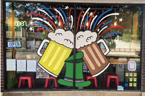
The Leprechaun's Lab 630 East Douglas Avenue (307) 351-0229