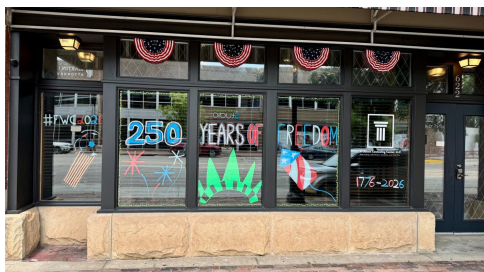
Architect Counseling Center 622 East Douglas Avenue