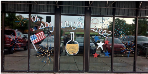
Viva La Olive 300 North Mead Street (316) 477-3005