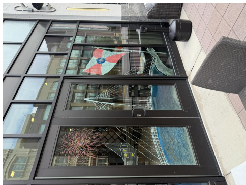
AC Hotel Wichita Downtown 105 South Broadway