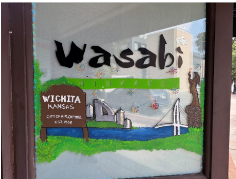
Wasabi Hinkaku 912 East Douglas Avenue (316) 927-3524