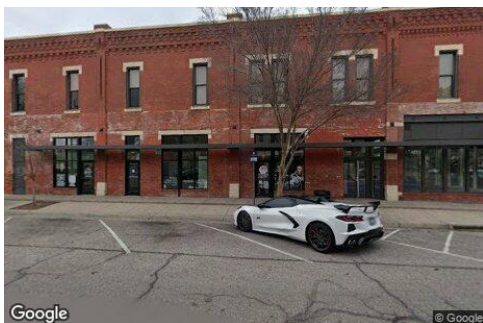
Skin Is In Studios 104 Saint Francis (316) 351-8070