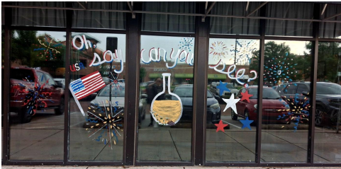
Viva La Olive 300 North Mead Street