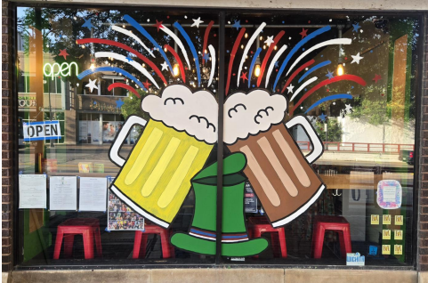
The Leprechaun's Lab 630 East Douglas Avenue