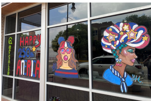
Eric Fisher Studio 645 East Douglas Avenue