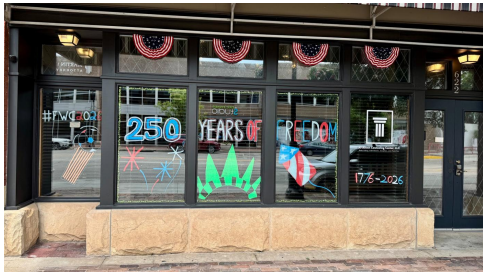
Architect Counseling Center 622 East Douglas Avenue