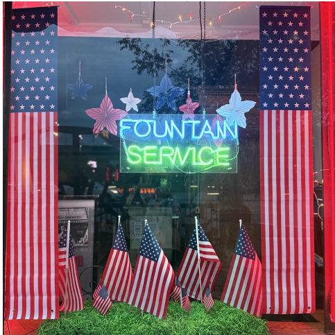
Old Mill Tasty Shop 604 East Douglas Avenue (316) 264-6500