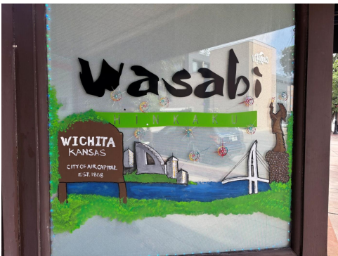
Wasabi Hinkaku 912 East Douglas Avenue