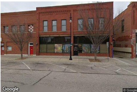
Wizard's Alley 114 North Saint Francis Avenue