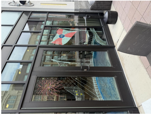
AC Hotel Wichita Downtown 105 South Broadway