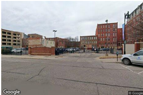
Eaton Place 517 East Douglas Avenue