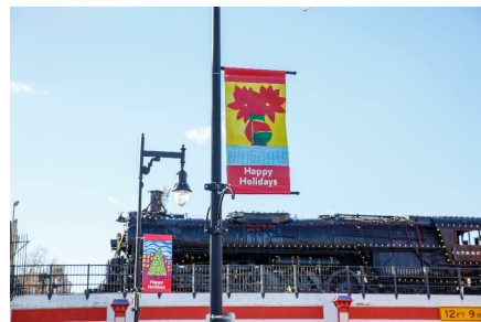
USD 259 Holiday Banners