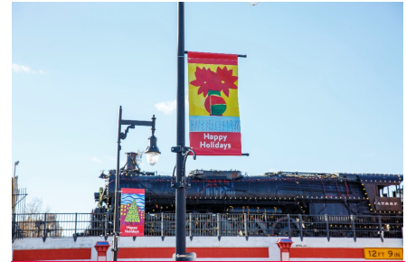
USD 259 Holiday Banners