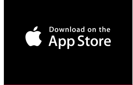
myStop Mobile for iOS