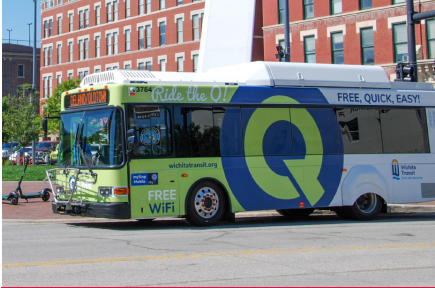
Ride the Q!