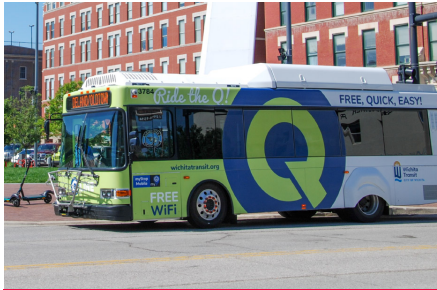
Ride the Q!