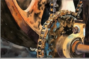
Joe Schlimm, Chain Reaction, Watercolor