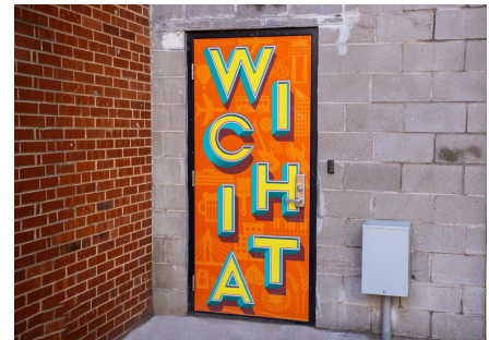
High Touch Technologies