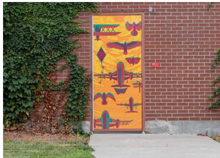
INTRUST Bank Arena