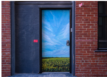
Gallery Alley - Cohlma Marketing Building