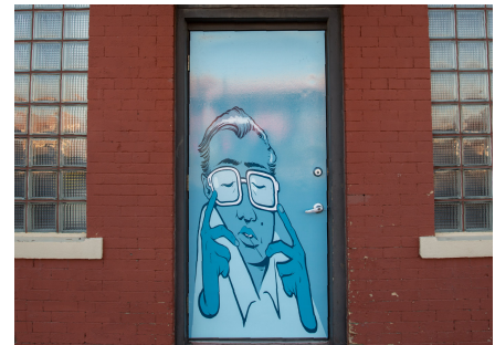
Jury Eye Care