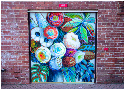
Hotel Old Town