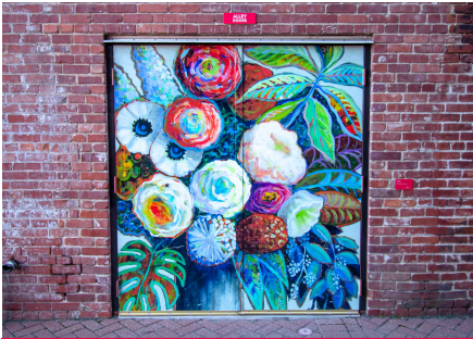
Hotel Old Town