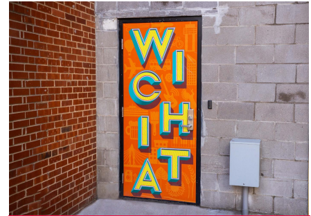
High Touch Technologies