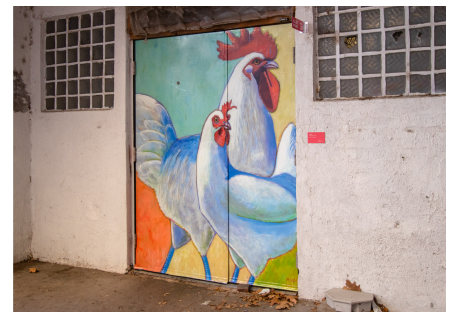
Old Mill Tasty Shop