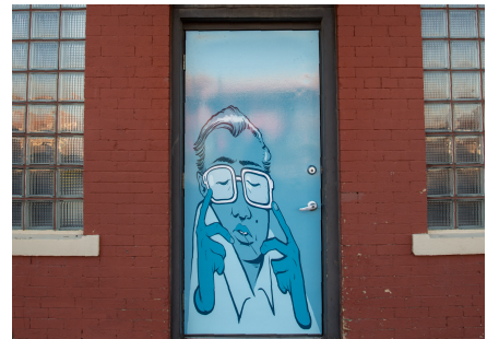
Jury Eye Care