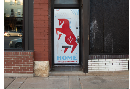
Standard Issue Company