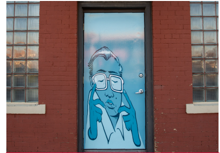
Jury Eye Care