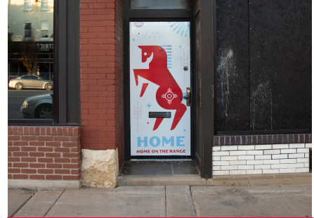
Standard Issue Company