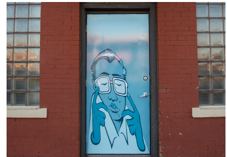
Jury Eye Care