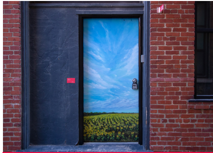
Gallery Alley - Cohlma Marketing Building