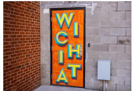
High Touch Technologies