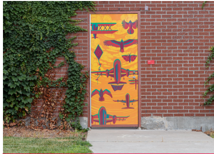
INTRUST Bank Arena