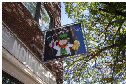
The Leprechaun's Lab