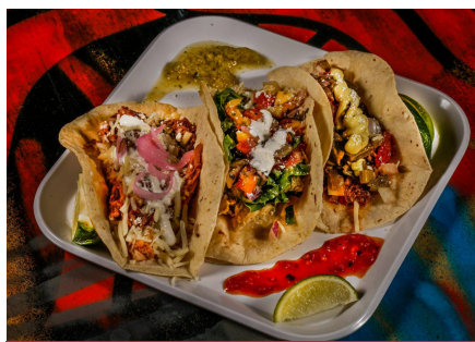
Adios Nachoria at Wave