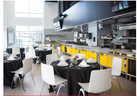
The Envision Bistro and Innovation Kitchen