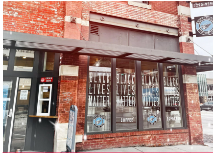
Espresso to Go Go (Disco)