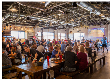
Norton's Brewing Company