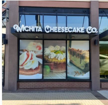
Wichita Cheesecake Company