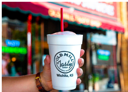
Old Mill Tasty Shop