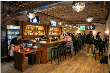
Solly & Jude's Sandwich Bar