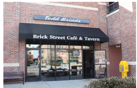
Todd Brian's Brick Street Café & Tavern