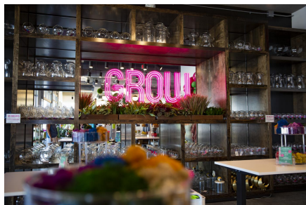
BOTANIC at GROW