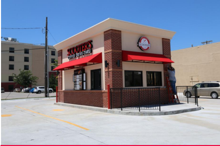
Scooter's Coffee - 2nd & Washington