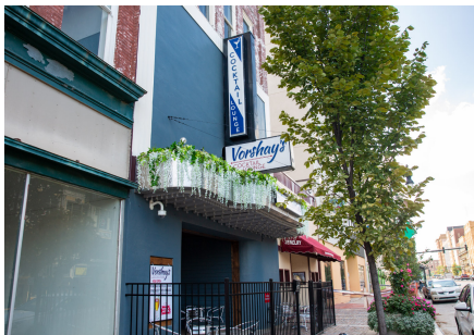
Vorshay's Cocktail Lounge