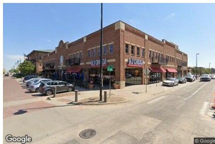
New Lemongrass Taste of Vietnam