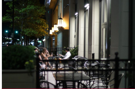
Siena Tuscan Steakhouse