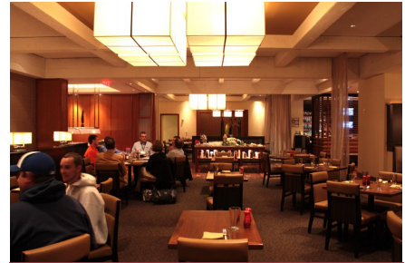
Harvest Kitchen and Bar