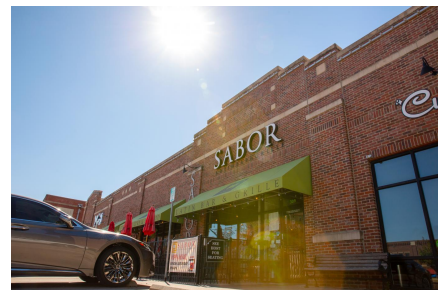
SABOR Latin Bar & Grill