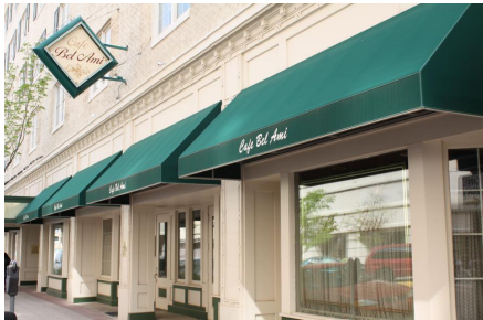
Cafe Bel Ami