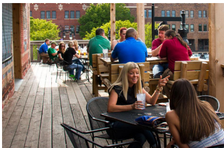
River City Brewery