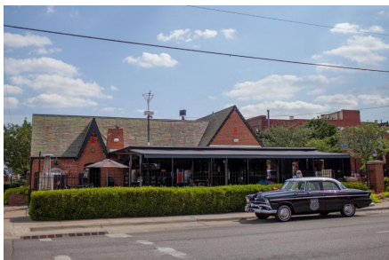
Morts Cigar & Martini Bar