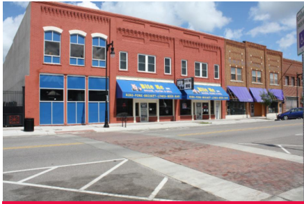
Bite Me BBQ