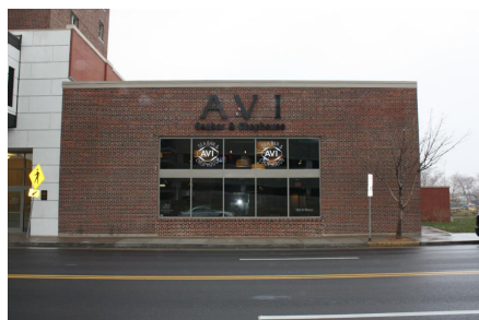
AVI Seabar & Chophouse