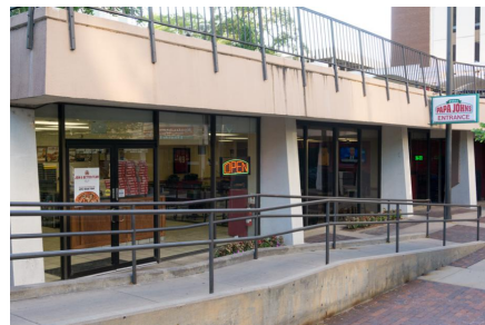
Papa John's Pizza