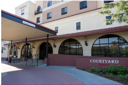
Table 820 Bistro