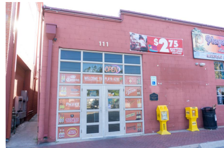
Playa Azul Mexican Restaurant