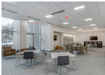
Roxie's on the River