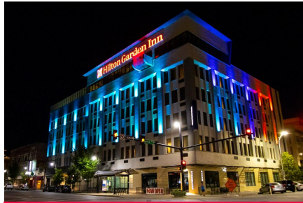
The 401 Pub at the Hilton Garden Inn