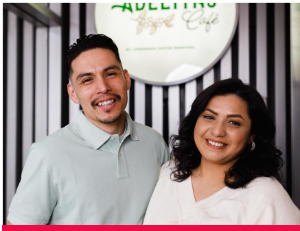
Las Adelitas Café by Esperanza Coffee Roasters