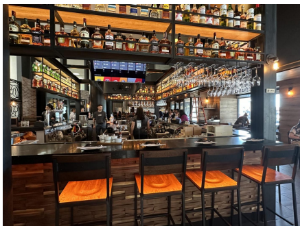
JINYA Ramen Bar - Downtown Wichita