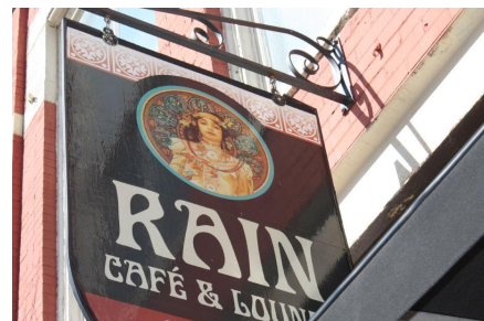
Rain Cafe and Lounge