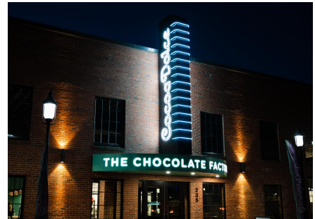
Cocoa Dolce Artisan Chocolates