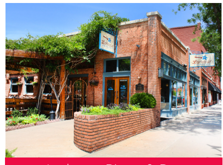
Larkspur Bistro & Bar