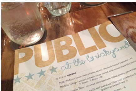
Public at the Brickyard