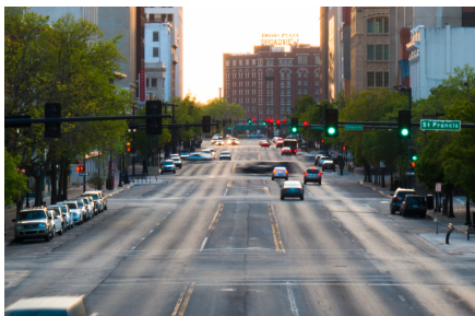
Douglas Avenue Design