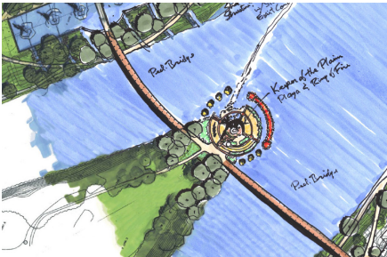
River Corridor Plan