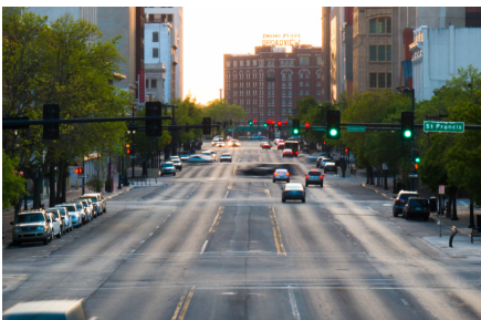
Douglas Avenue Design