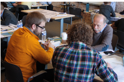
Market Studies & Plans