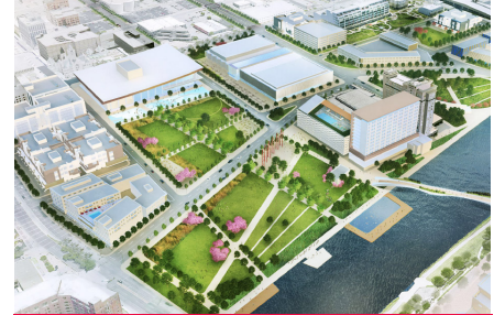
Riverfront Legacy Master Plan