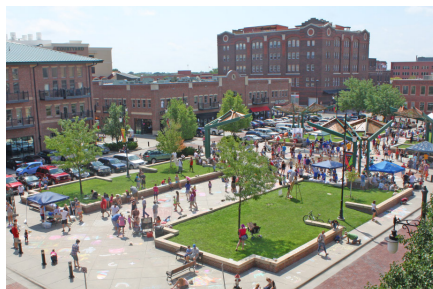
APA Great Places Award