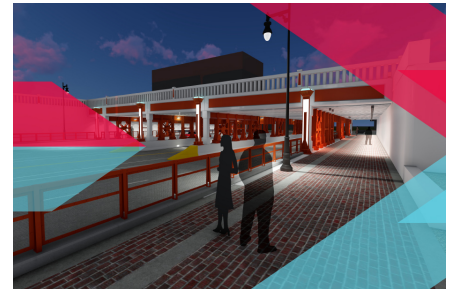
Douglas Ave. Underpass