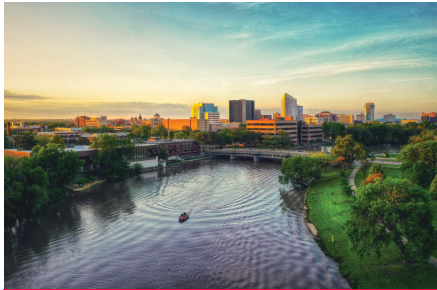
Downtown Wichita Action Plan