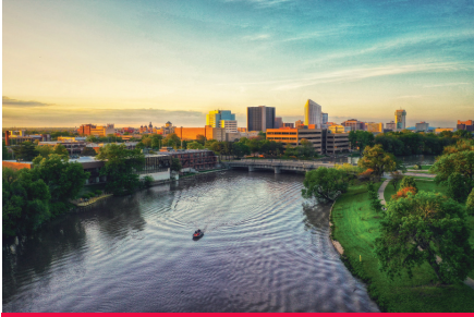
Downtown Wichita Action Plan