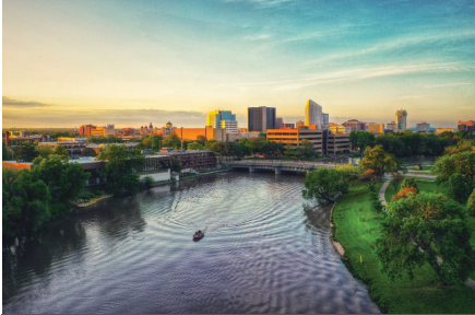
Downtown Wichita Action Plan