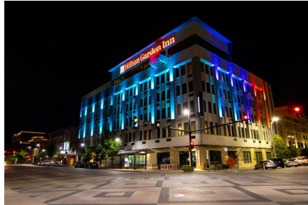
Hospitality for Every Lifestyle