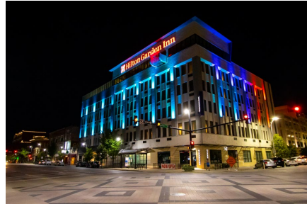
Hospitality for Every Lifestyle