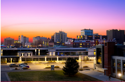
Project Downtown History