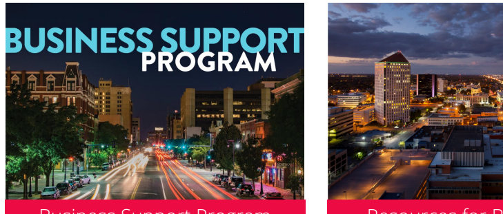
Business Support Program