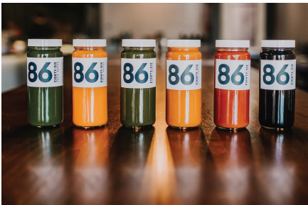
Discover 86 Cold Press

Watch his Possibility People video to learn more.